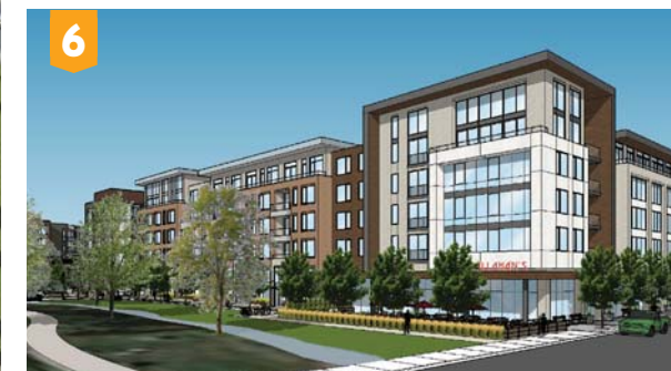
6 OPENING 4Q 2018 Ascent Westminster 270 units/24k s.f. retail