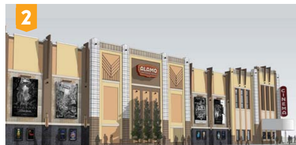
2 OPENING 4Q 2018 Alamo Draft House 9 screen theater/restaurant