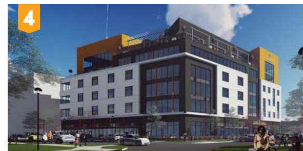
4 OPENING 1Q 2019 GRID Collaborative/Solera Salon 80k s.f. office/30k s.f. retail