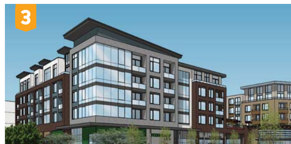
3 OPENING 3Q 2019 Sherman Associates 240 units/38k s.f. retail