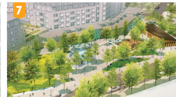
7 OPENING 2Q 2018 Central Square 1.2 acre plaza