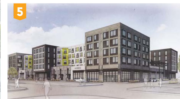
5 OPENING 4Q 2018 Mile High/Koelbel/LongsPeak 118 units/20k s.f. retail