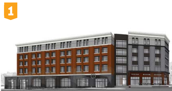
1 OPENING 1Q 2019 Origin Hotel/Marczyk Fine Foods 125 room boutique hotel w/retail