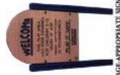
WELCOME AGE-APPROPRIATE SIGN