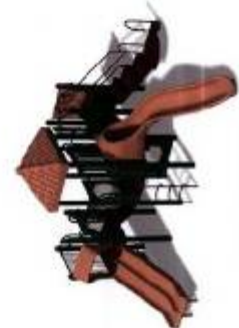
TODDLER PLAY STRUCTURE