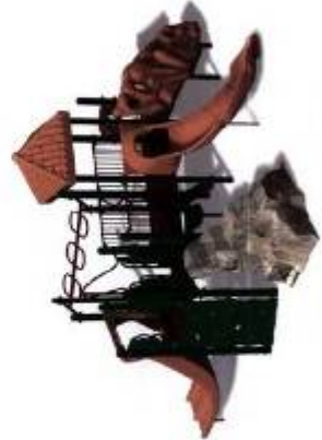
SCHOOL AGE PLAY STRUCTURE