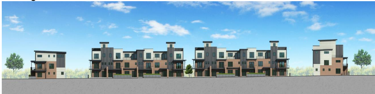
SHARED STREET ELEVATION (EAST) SCALE: NTS