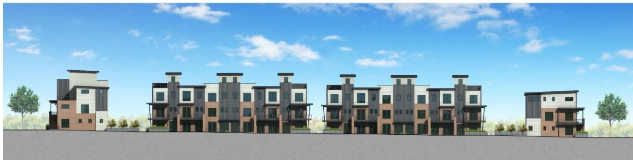
HARLAN STREET ELEVATION (WEST) SCALE: NTS

** Please note, the site plan and elevations have not been approved by the City and are subject to change in future submittals and before approval.**